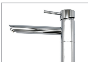
Bromic Vented Mixer Tap included with our Bromic Storage Water Heater 5L Underbench kit (HF-UH5)