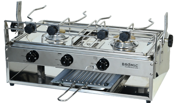
2020069-1 Marine Lido Junior

Hose & regulator not included. Product No. 6260514 sold separately.