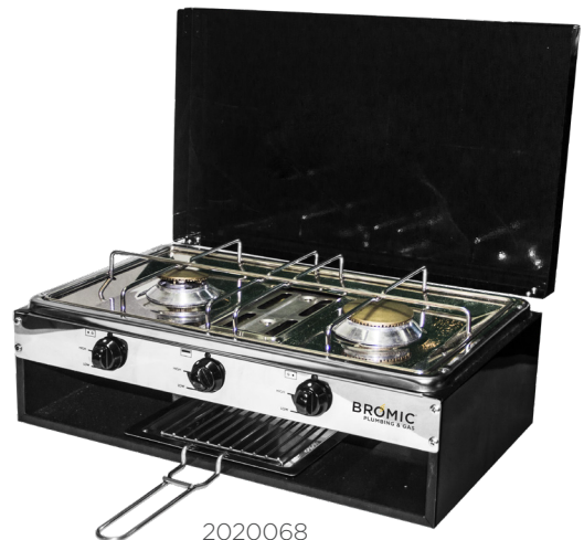
2020068 Camper Lido Junior

Hose & regulator not included. Product No. 6260514 sold separately.