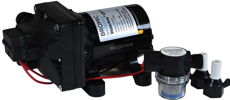
PART No. 7575160 WATERBOY™ 12V PUMP. MAX. FLOW RATE 11L/MIN