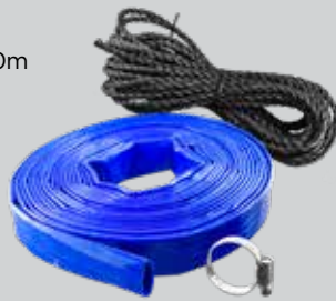
Part No. 7575129 Waterboy™ Submersible Pump Hose Kit