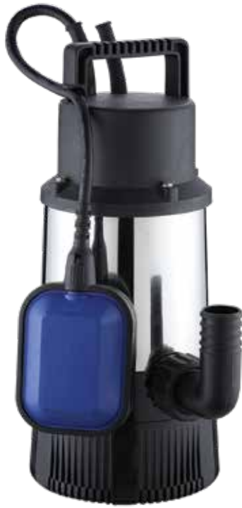
PART No. 7575127 WATERBOY™ SUBMERSIBLE PUMP 50L CLEAN WATER