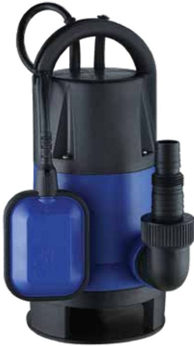
PART No. 7575126 WATERBOY™ 900W SUBMERSIBLE PUMP