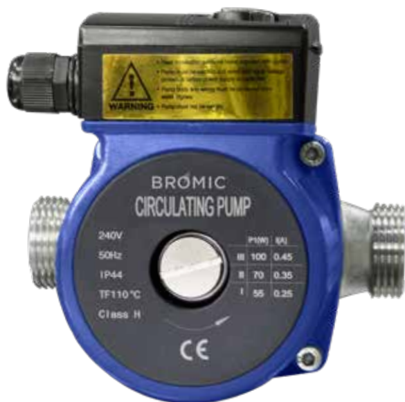
PART No. 7575250 WATERBOY™ CIRCULATION PUMP