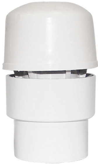
PART No. 1210701 AIR ADMITTANCE VALVE WITH ADAPTOR