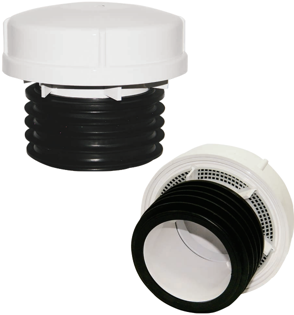
PART No. 1210702 AIR ADMITTANCE VALVE 110MM