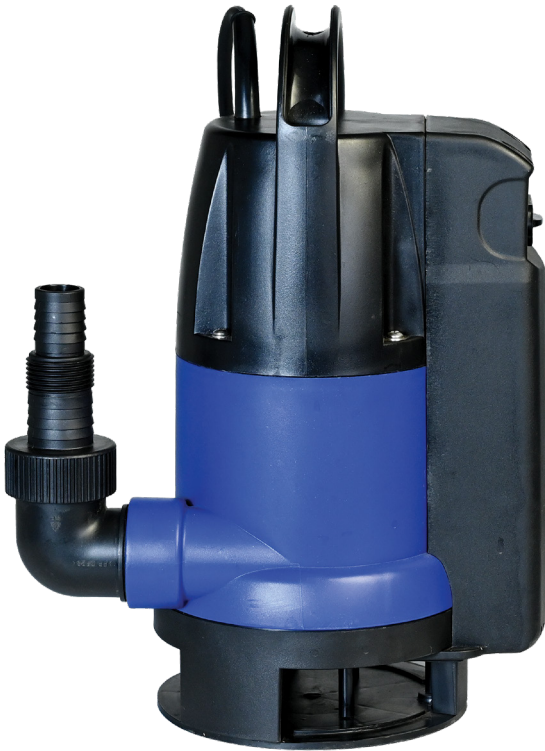
7575132 Waterboy™ 750W Dirty Water Submersible Pump with Vertical Float