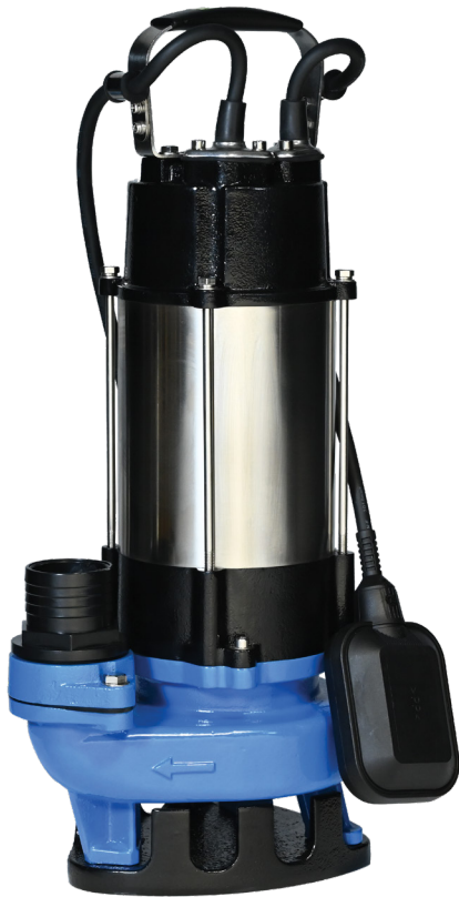
7575155 Waterboy™ 300L Vortex Submersible Pump