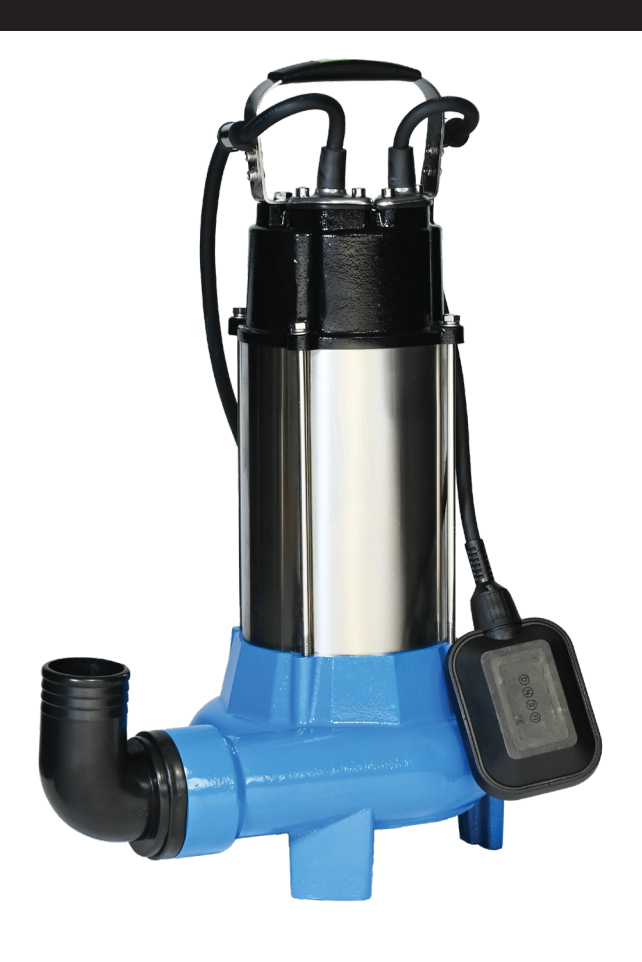
7575170 Waterboy™ 270L Cutter Pump