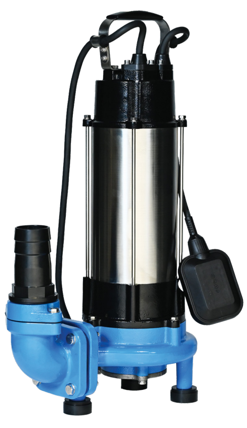
7575180 Waterboy™ 250L Grinder Pump