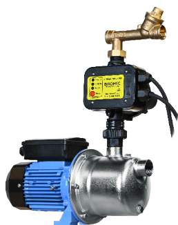
7575120-1 40L Hydro Switch™ Jet Pump Pack