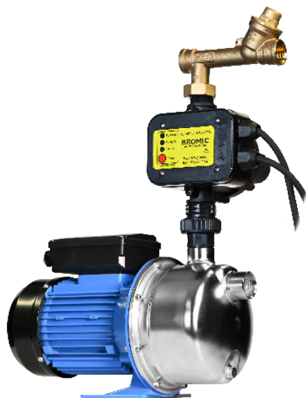
7575121-1 60L Hydro Switch™ Jet Pump Pack