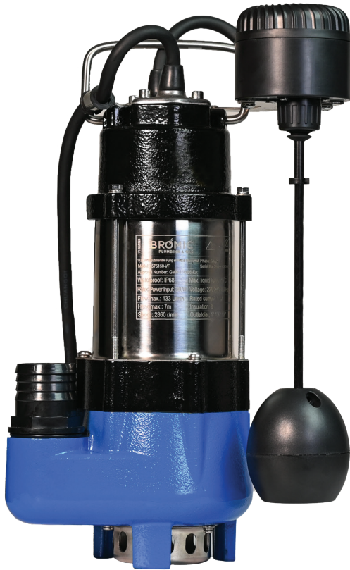
7575150-VF Waterboy™ 133L Vortex Pump with Vertical Float Switch