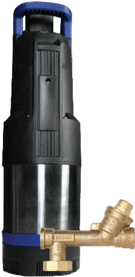
Part No. 7575134-RTM