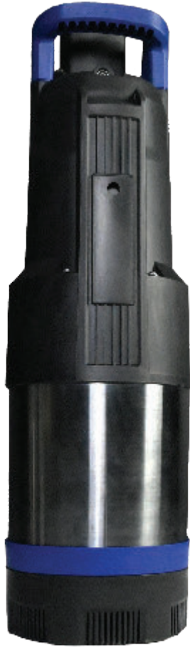
Part No. 7575134 WATERBOY™ 800W SUBMERSIBLE PUMP WITH INTERGRATED CONTROLLER